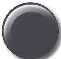
Magnetic Gray Metallic