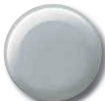
Classic Silver Metallic