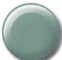
Sea Glass Pearl