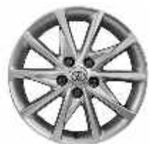
17-in. 10-spoke alloy wheels