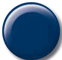
Blue Ribbon Metallic