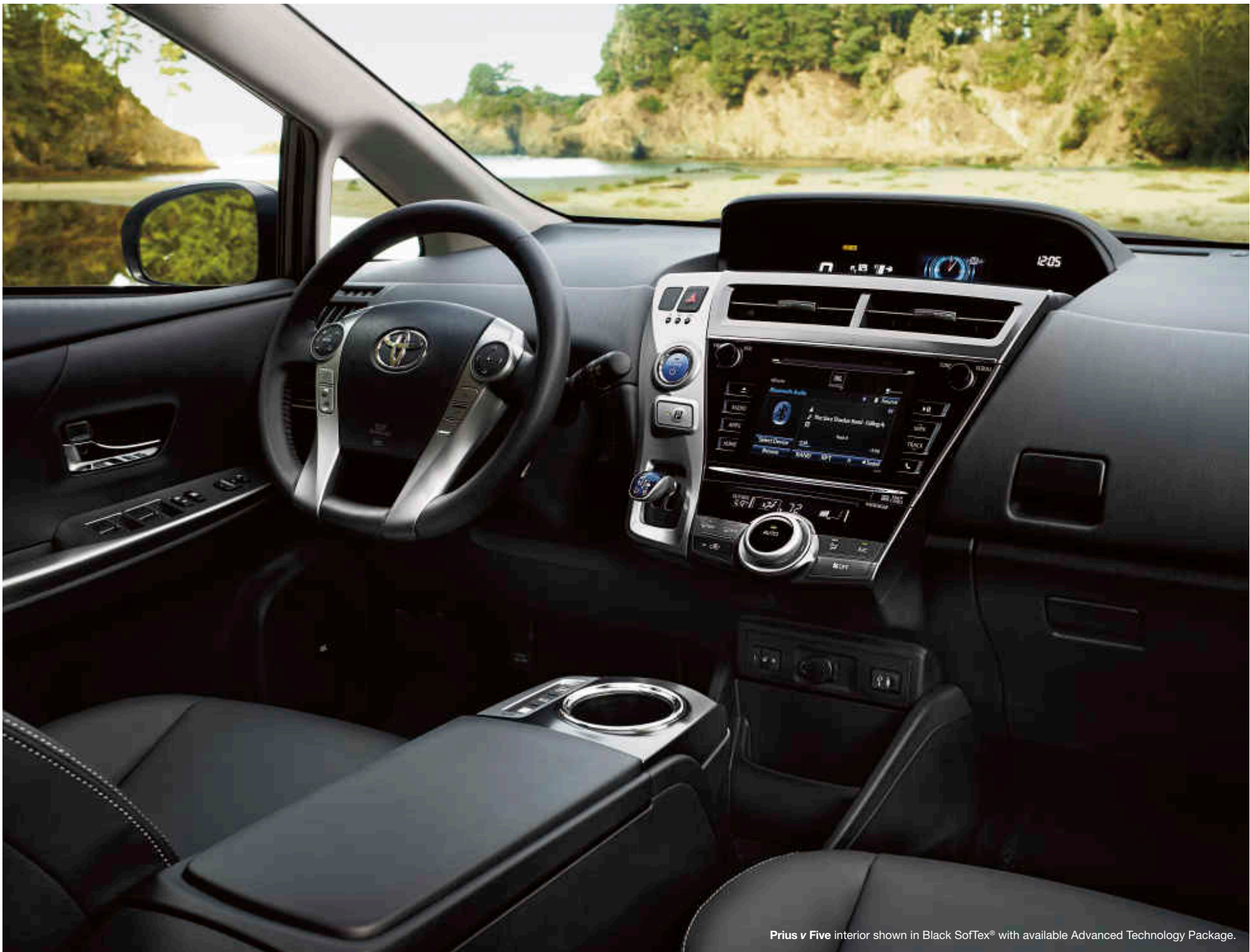
Prius v Five interior shown in Black SofTex® with available Advanced Technology Package.