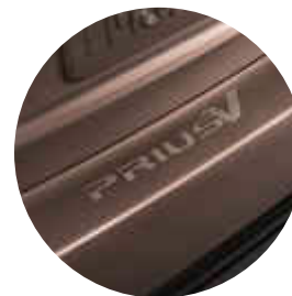
Rear bumper appliqué

Rear bumper appliqué Remote Engine Starter 38 Security system Universal tablet holder