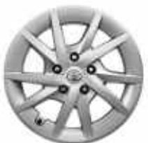
16-in. 10-spoke alloy wheels with full wheel covers