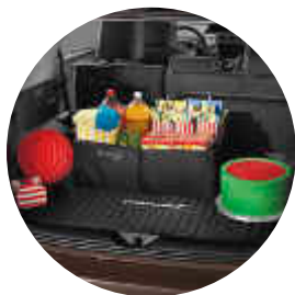
Cargo tote 34

All-weather floor liners 36 Alloy wheel locks Ashtray cup Cargo net — envelope