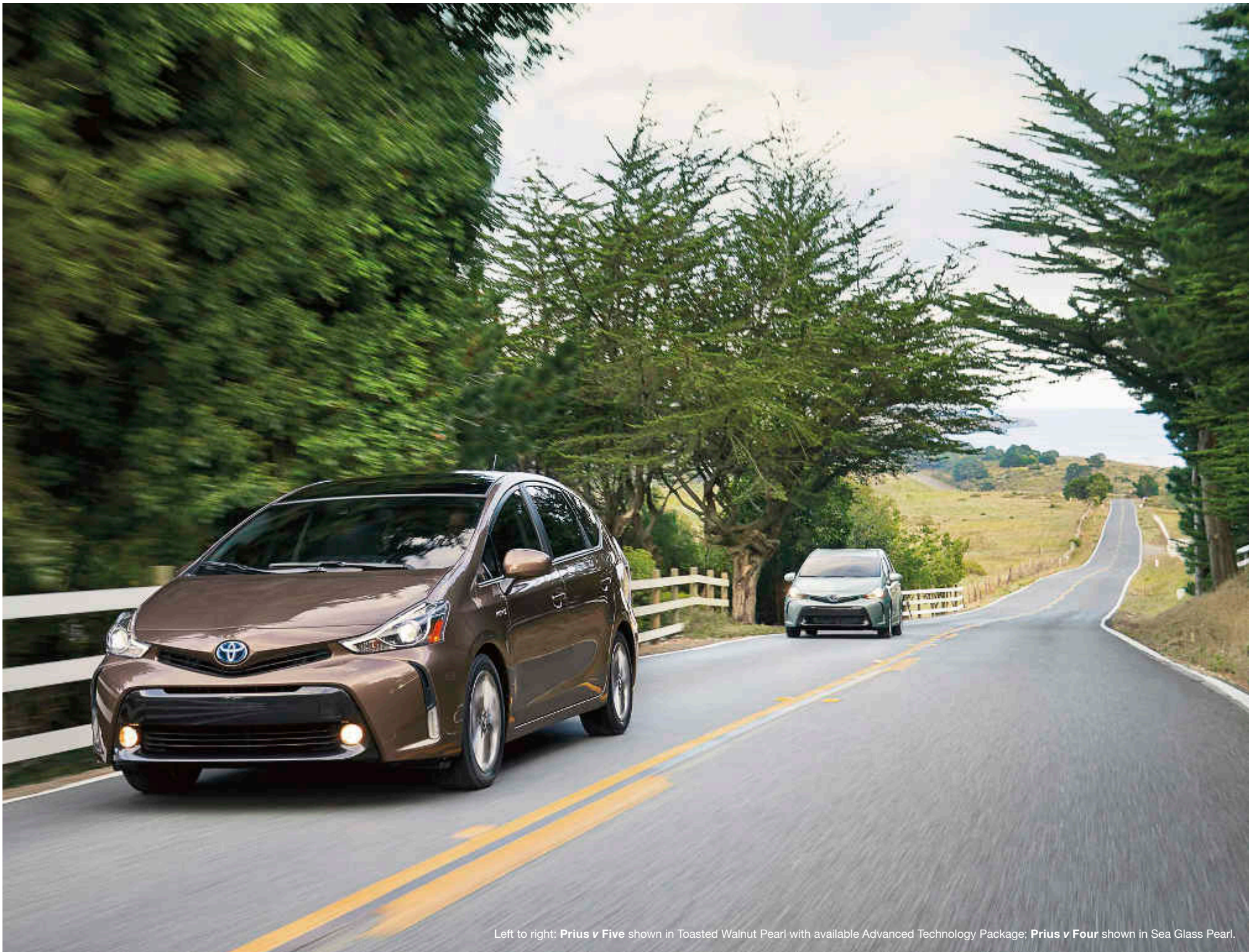
Left to right: Prius v Five shown in Toasted Walnut Pearl with available Advanced Technology Package; Prius v Four shown in Sea Glass Pearl.