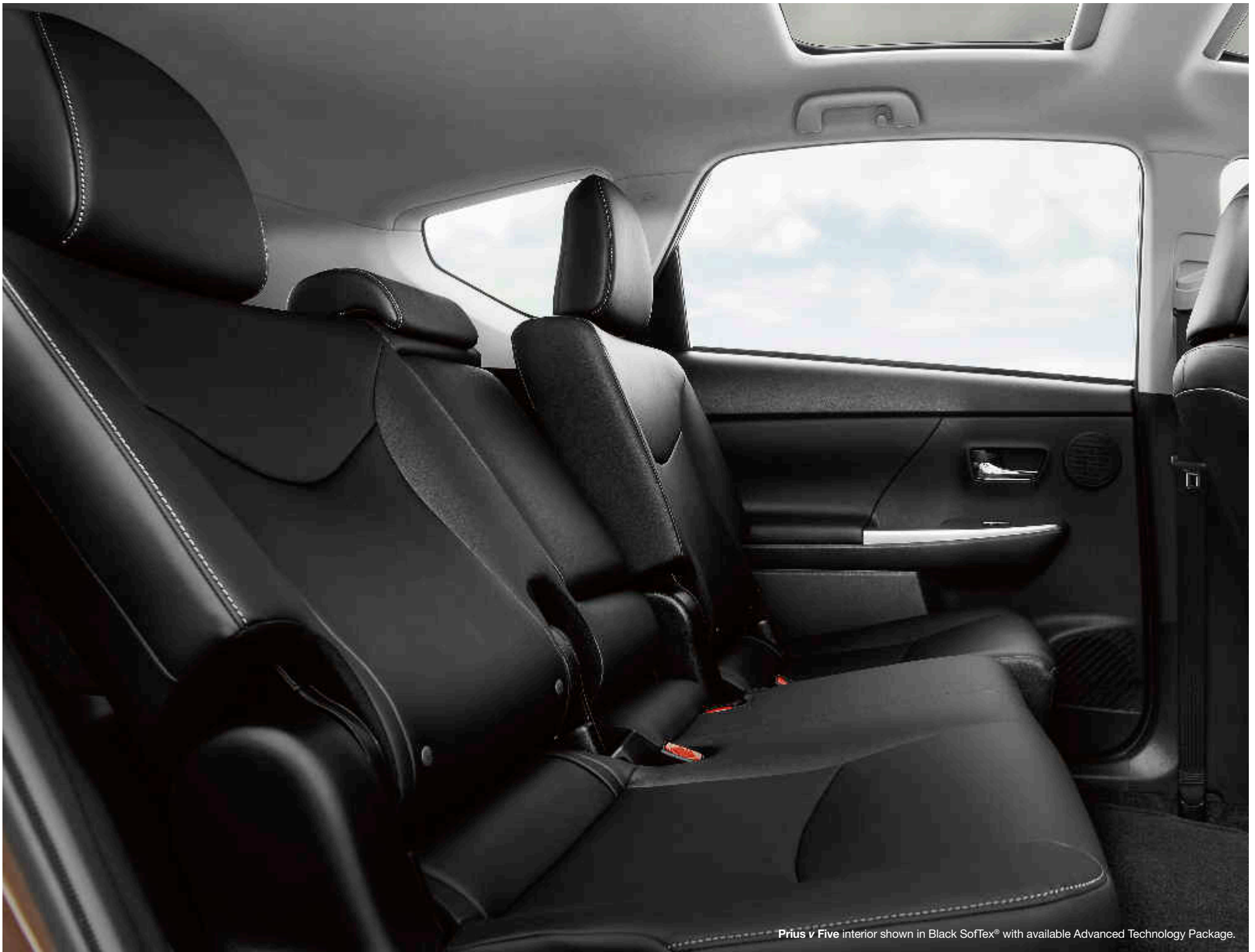
Prius v Five interior shown in Black SofTex® with available Advanced Technology Package.