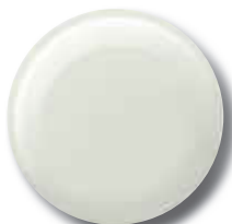
Blizzard Pearl 1