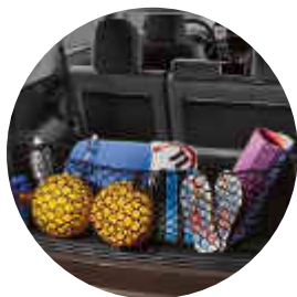
Cargo net — envelope

Cargo tote 34 Cargo tray Carpet cargo mat Carpet floor mats 36