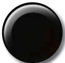
Midnight Black Metallic