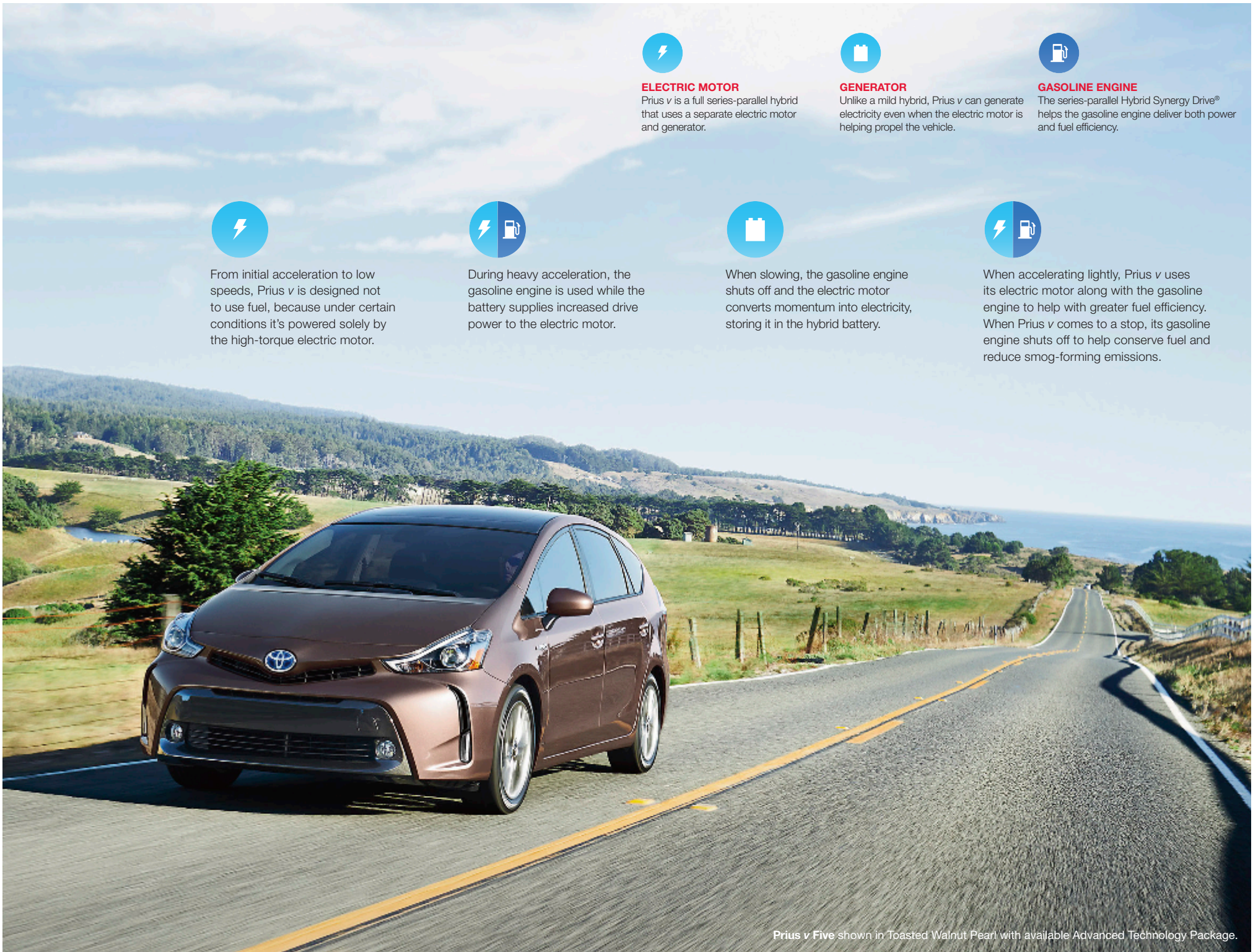
Prius v Five shown in Toasted Walnut Pearl with available Advanced Technology Package.

The series-parallel Hybrid Synergy Drive® helps the gasoline engine deliver both power and fuel efficiency.