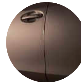
Door edge guards

Rear bumper appliqué Remote Engine Starter 38 Security system Universal tablet holder