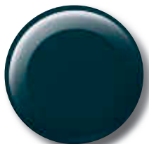
Galactic Aqua Mica