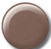
Toasted Walnut Pearl