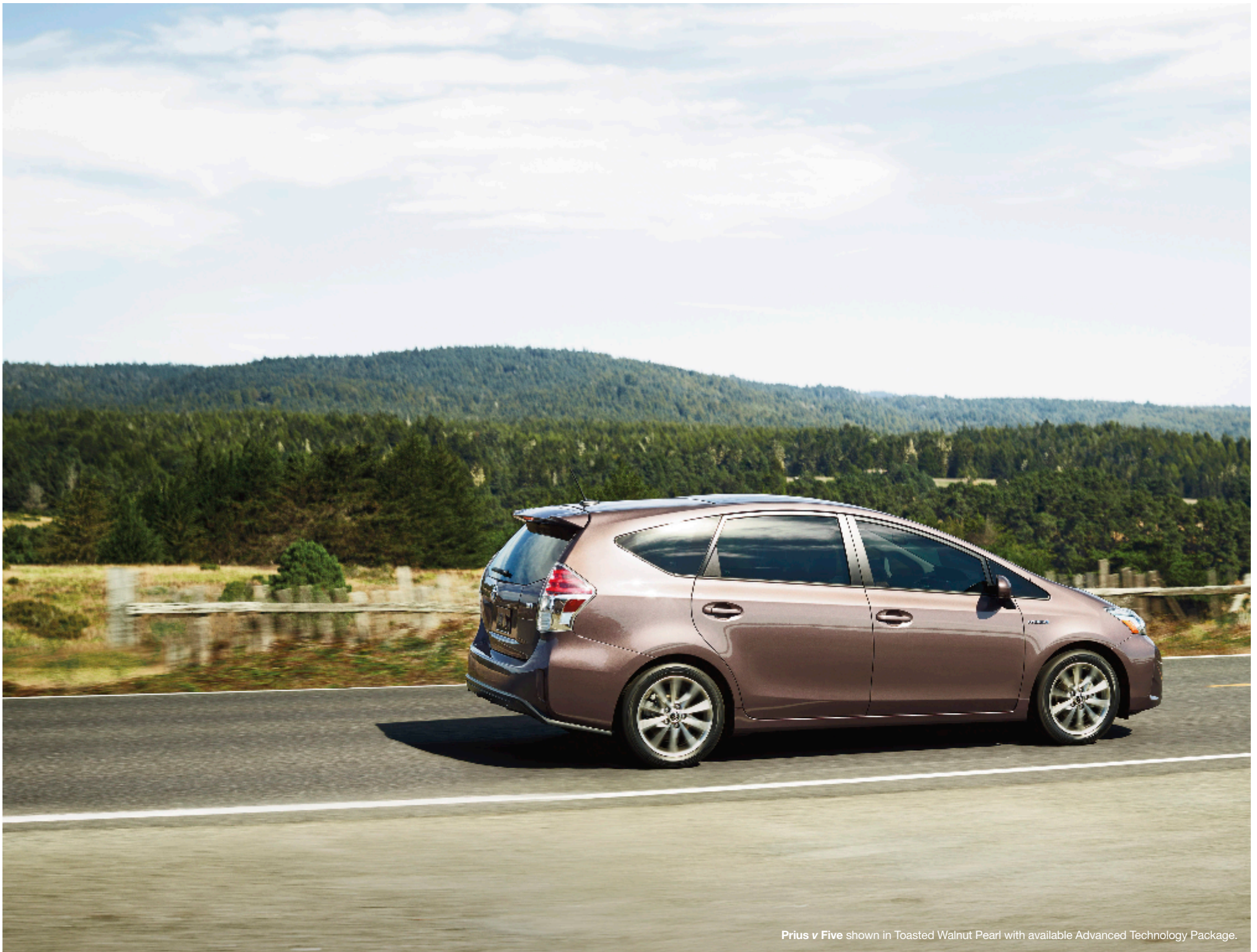
Prius v Five shown in Toasted Walnut Pearl with available Advanced Technology Package.