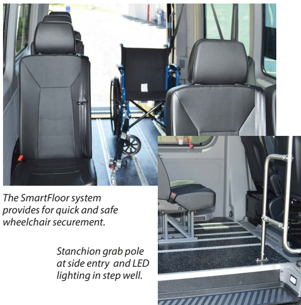
The SmartFloor system provides for quick and safe wheelchair securement.